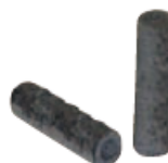
MonoTrap RGPS TD

Product name: MonoTrap RGPS TD Cat.No.:1050-74202