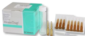
MonoTrap Trial Kit for TD

GL Sciences disclaims any and all responsibility for any injury or damage which may be caused by this data directly or indirectly. We reserve the right to amend this information or data at any time and without any prior announcement.