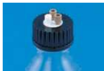
Cap for 1/8 in. Tubing Insertion