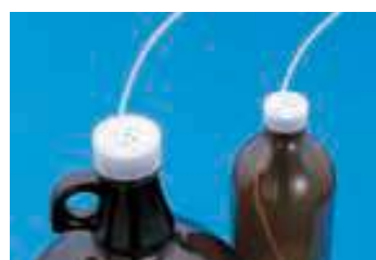
Solvent Reservoir Caps